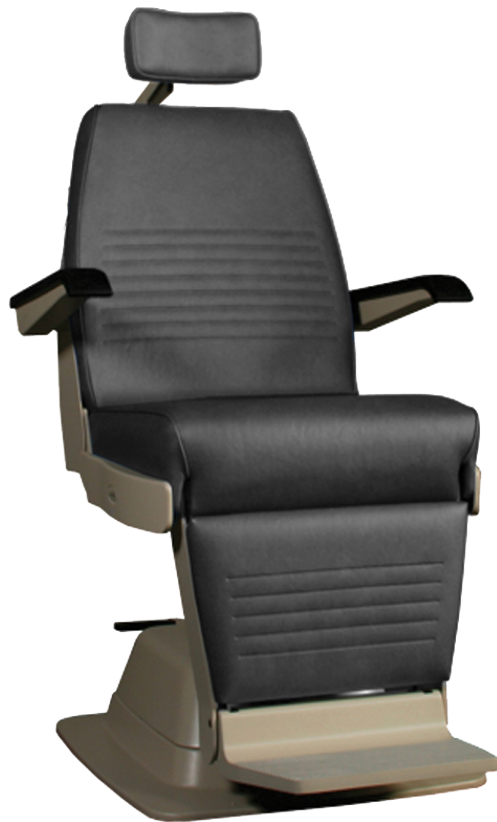
MARCO OPHTHALMIC CHAIR ENCORE 1280